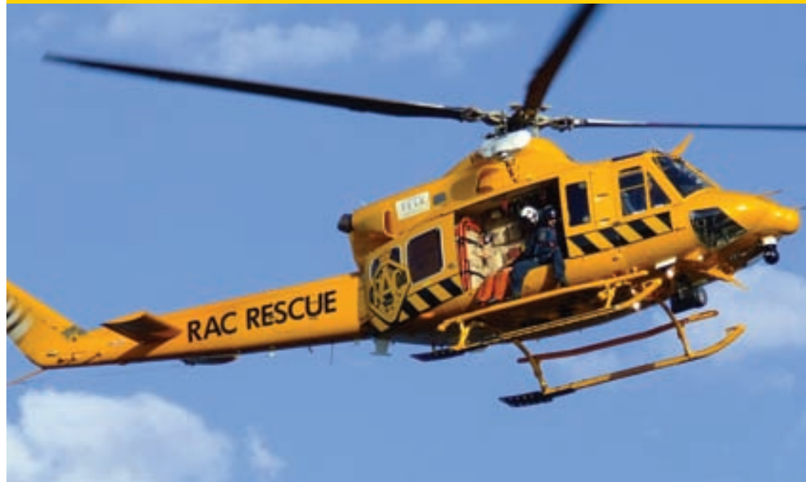
The RAC Rescue Helicopter

The RAC joined forces with the WA Football Commission in 2008 to support the RAC Football Volunteer of the Year program and