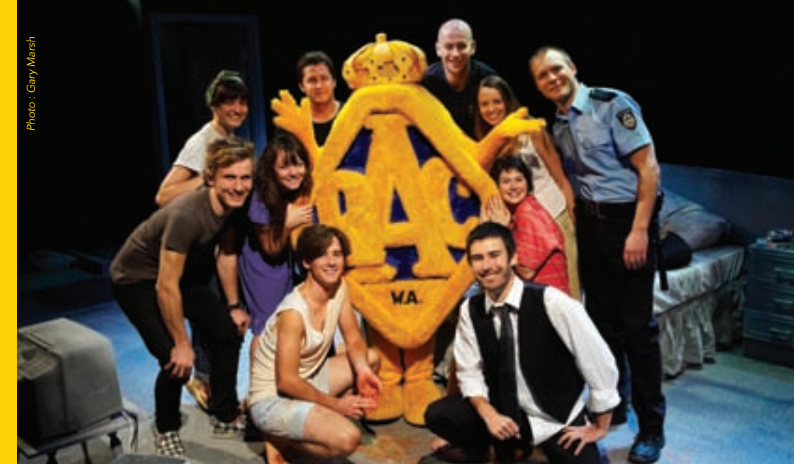
The 2009 HotBed Ensemble with the RAC Happy Man