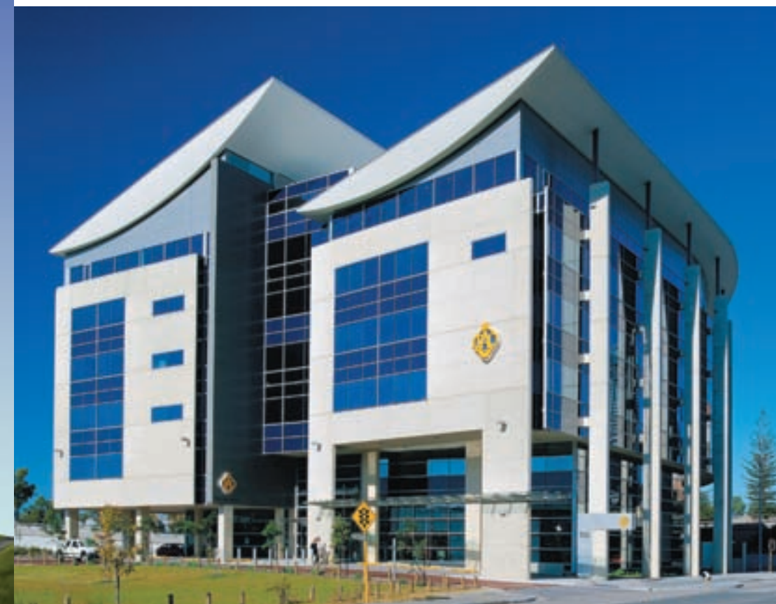
The RAC Head Office Building, West Perth

The RAC head office building is based on environmentally sustainable design principles and has been awarded a four-star NABERS Energy rating for the base building from the Department of Environment, Climate Change and Water.