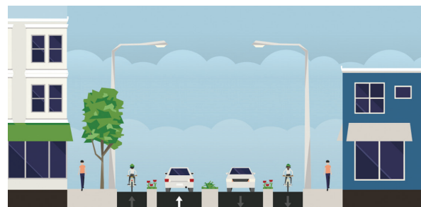
Pop-up bike lanes 4