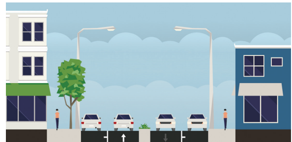
Typical street layout 4